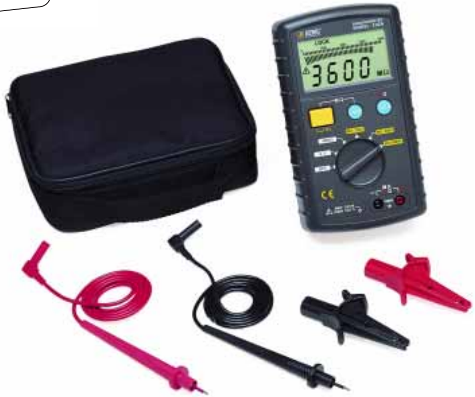
Soft carrying case and test leads included